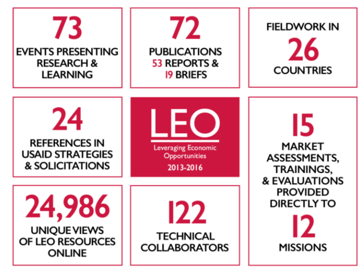
Figure 1: LEO By the Numbers: Key Metrics

well suited to sensing and evaluating change. Thirdly, the project furthered the practical application of facilitation through an extensive set of easy-to-use and widely disseminated tools and training materials along with in-person capacity building and peer-to-peer learning. Through its research into wage labor and sustainable poverty escapes, LEO was also a leading voice in raising the profile of wage labor and the links between poverty dynamics, resilience, and systems approaches. Lastly, LEO's work in women's economic empowerment rallied engagement throughout the Agency and its implementing partners to highlight the importance of agency in women's empowerment within systems and in particular to create guidance for practitioners to respond to USAID's now requisite Women's Empowerment in Agriculture Index (WEAI), in a manner that is consistent with market systems development best practices.