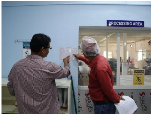
Discussion on food safety aspects during the audit.

“Continuous support from the experts through training and technical assistance has helped us to establish and implement a robust food safety system within the organization. We could formalize the food safety practices and establish a proper documentation system. Furthermore, we are confident that we can proceed for HACCP implementation and certification as well.”