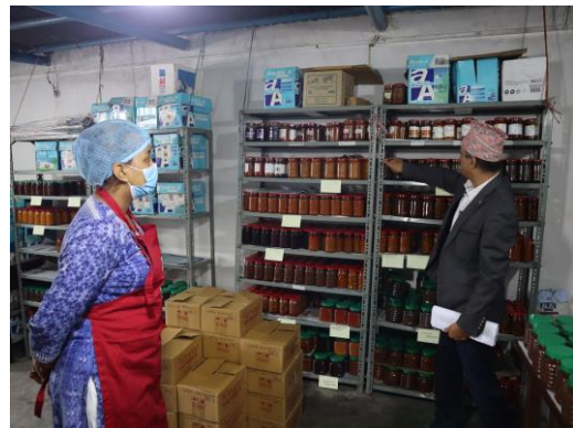
Site tour during the audit of the fruits and vegetables processing GFB.

In response to BD4FS training and technical assistance, many businesses that participated in the audit have already made investments to improve their food safety practices. Such improvements include new testing laboratory equipment, infrastructure changes, cleaning and sanitation practices, using appropriate equipment and tools, proper uniforms, proper handwashing stations, measuring and monitoring equipment calibration, etc. Some investments were less expensive but still highly effective; these include reorganizing a facility's workflow, cleaning practices, establishment of procedures and formats for record keeping, and following a strict operational parameter.