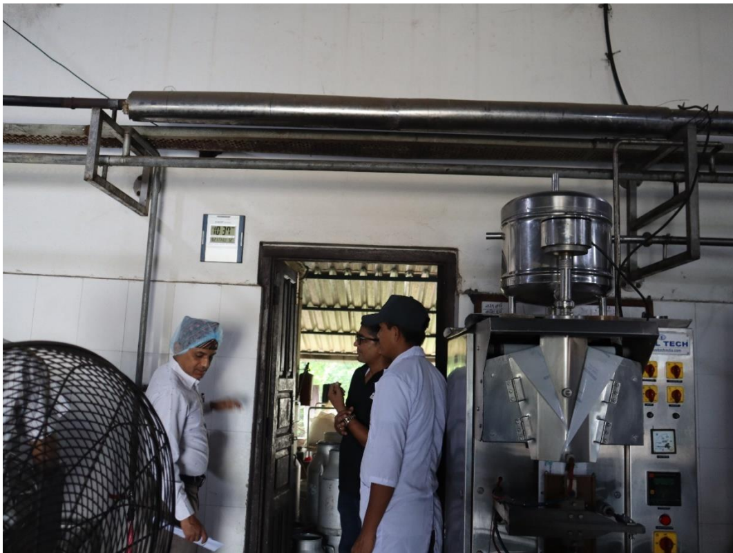
BD4FS Auditor engaging with employees at Pawan Dairy Udhyog in Chitwan.

This publication was made possible by the generous support of the American people through the United States Agency for International Development (USAID). The contents are the responsibility of the authors and do not necessarily reflect the views of USAID or the United States Government.