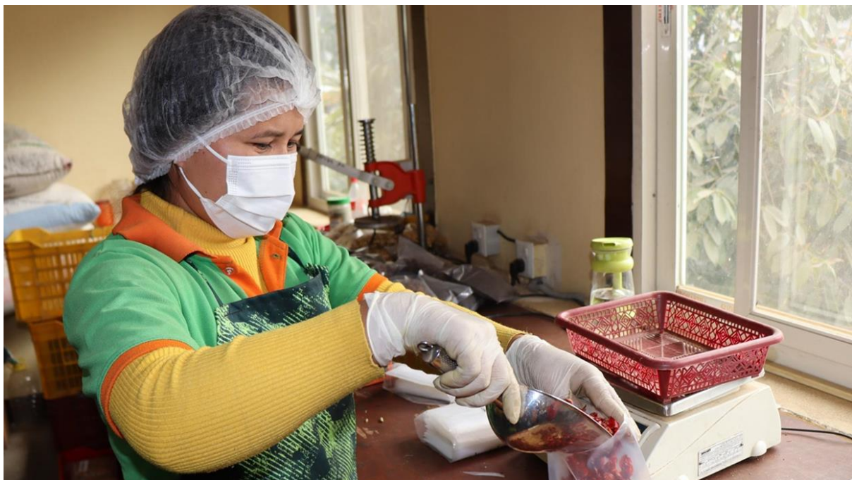
Proper food handling at Muna Krishi Limited, Laitpur, Nepal.