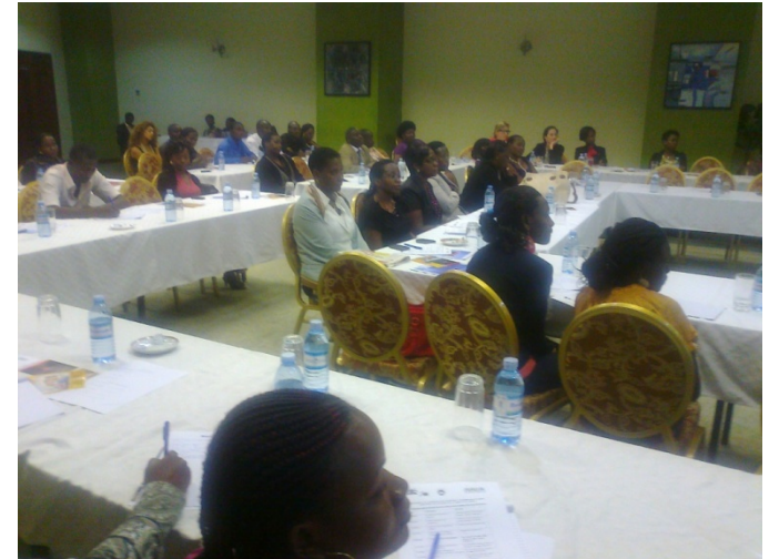
Uganda Real Estate Conference