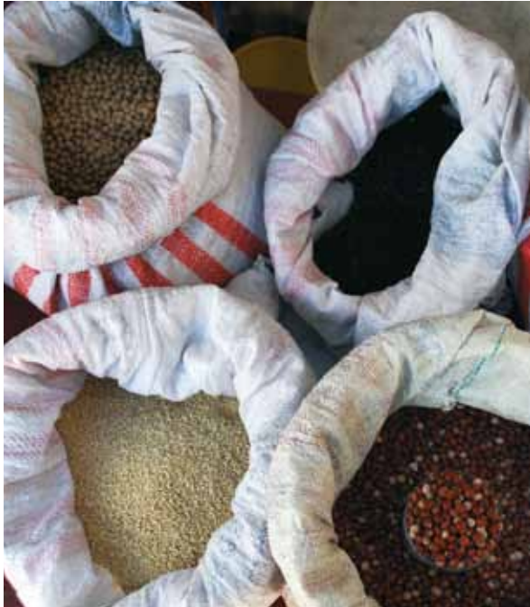
With the support of the community canteen programme and the profits made, several restauratrices (street cooks) have been able to start or rejuvenate their businesses. This provides local communities with access to important food stuffs, such as rice, sugar, beans, pasta and coal.