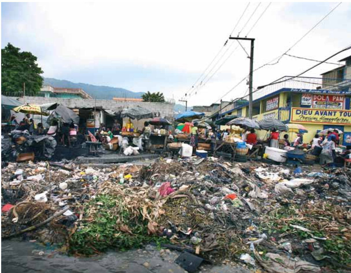
Rubbish lines the streets of the Carrefour Feuilles, district of Port-au-Prince.