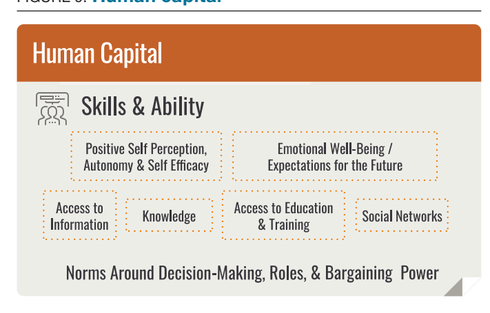
FIGURE 9. Human capital

enabled girls to stay in school an additional six months (Chiapa, Prina, and Parker 2016).