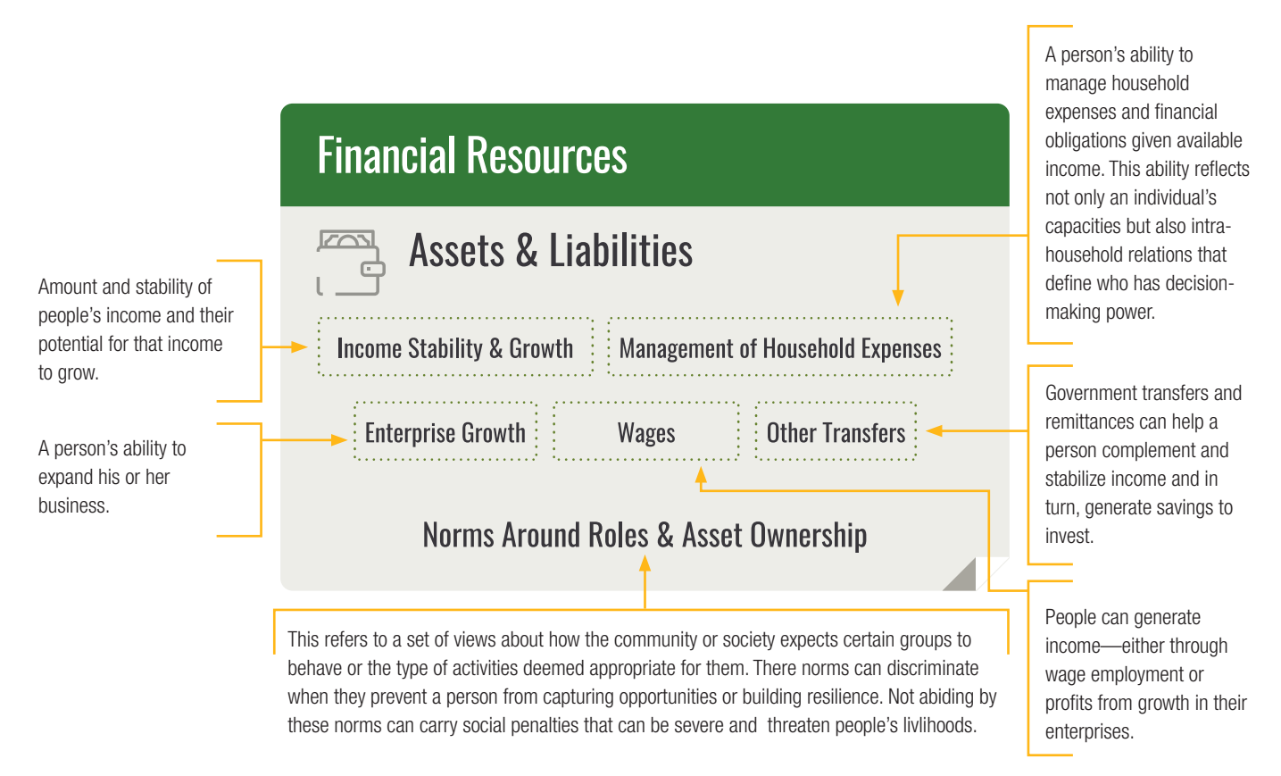
FIGURE 2. Financial resources

It follows that poor people seek to build financial resources by accumulating financial assets and managing liabilities through financial services. For example, financial services can help a household smooth and increase their income, manage expenses, invest in enterprise growth or better employment, and transfer money to cope with shocks or to invest. See Figure 2.