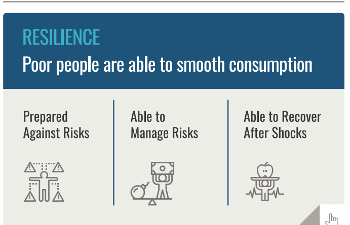
FIGURE 6. Resilience

Our TOC illustrates evidence that suggests that a person's financial resources, such as savings, assets, and income stability, determine their resilience level—their ability to cope and recover from shocks. This can be done by withdrawing savings or selling assets when shocks occur. Furthermore, a person's human capital, including education, business knowledge, and access to information, can help him or her prepare for shocks to come. For example, this person may be able to get a more stable job, locally or through migration, that allows that person to accumulate savings and assets that can be used to cope with shocks. Similarly, physical capability, including health, nutrition, and physical access to markets, allows a person to execute strategies to cope and recover from shocks—for example, having the strength to work at a job that allows that person to accumulate savings and assets to deal with shocks.