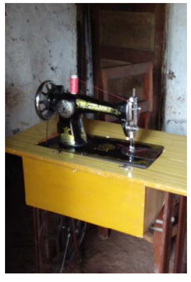
Youth are interested in developing technical training skills in the areas of agribusiness, tailoring services, carpentry, mechanics, and cooking.

clear ideas about what they wanted to with their lives. As mentioned earlier, at least 36% of Rwandan youth were head of household with the responsibility of caring for three to five younger siblings on their own.