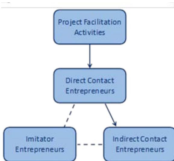
Figure 3. Project Outreach Categories

Three distinct categories of project outreach can be identified, as shown in Figure 3. Direct contact entrepreneurs are those who interact with project-funded personnel, activities, or materials, such as by participating in a training course conducted with project funding or by receiving improved inputs as part of the project facilitation activities. An indirect contact entrepreneur is vertically linked to a direct contact entrepreneur. Project interventions reach smallholders indirectly through their commercial relationships in the value chain and its supporting markets. There are several examples of smallholders who are reached as indirect contacts through their vertical linkages to input suppliers and lead firms that buy their products, such as exporters or supermarkets. The imitator entrepreneurs are reached through project demonstration effects of successful new practices and business models. These spillover effects may turn out to be the largest part of project outreach, although the cumulative effects can be expected to start relatively small and build over time. Still, there are no standards for estimating and reporting the number of smallholders reached through spillover effects.